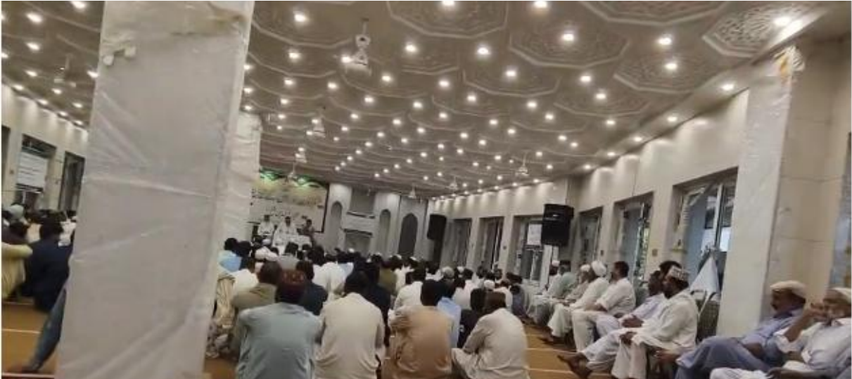
Despite all Construction Salah & Programs e.g. Seminars & Lectures have been conducted to use Masjid